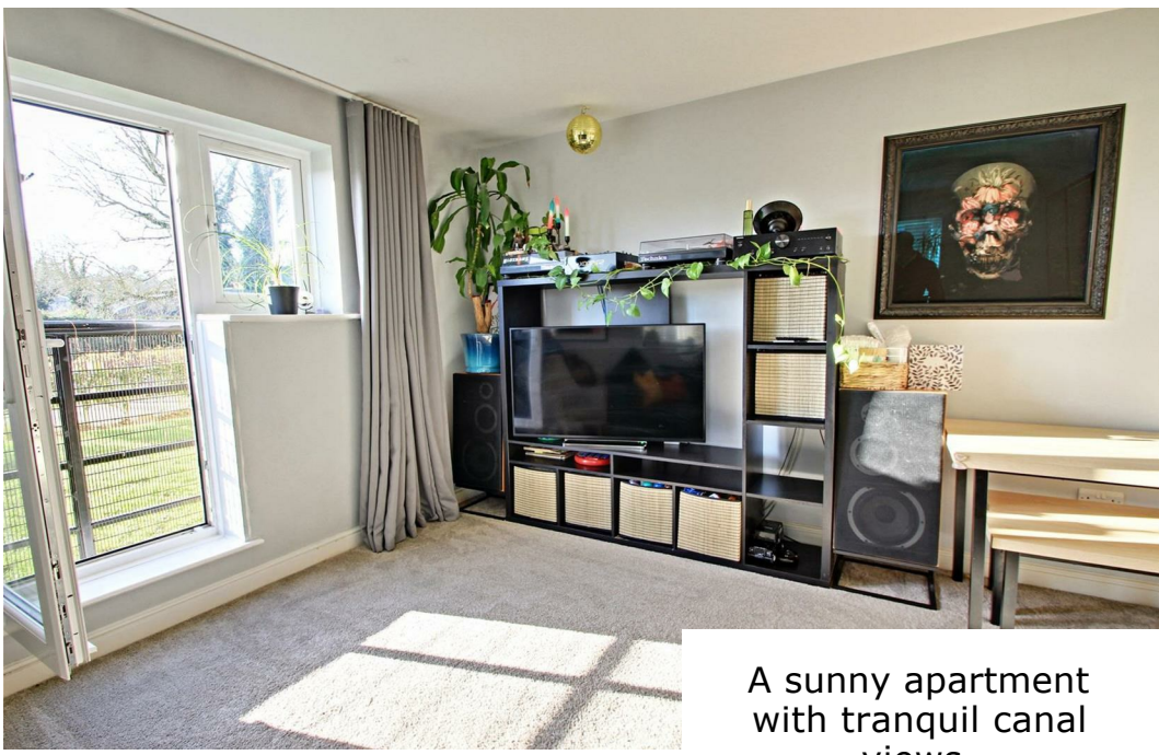
A sunny apartment with tranquil canal views.